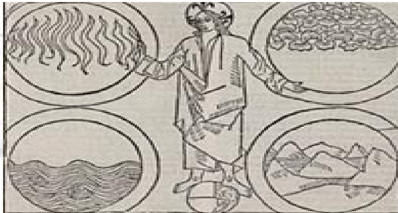
The Four Elements