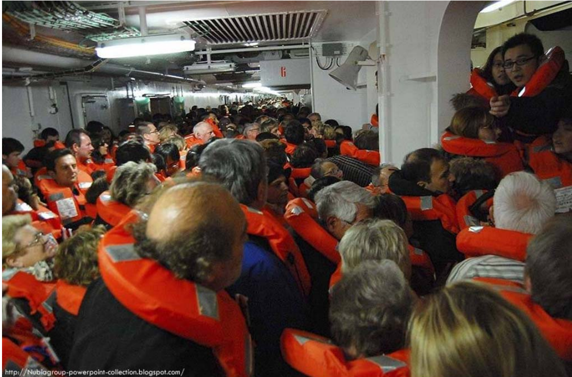
Giglio, Italy — A photo taken by a passenger shows other passengers waiting to be evacuated after the Costa Concordia ran aground.

By his hand the crew and the passengers lived an experience of 12th House, all of them confined in a small restricted area, tense, waiting for orders to be evacuated: a nightmare!