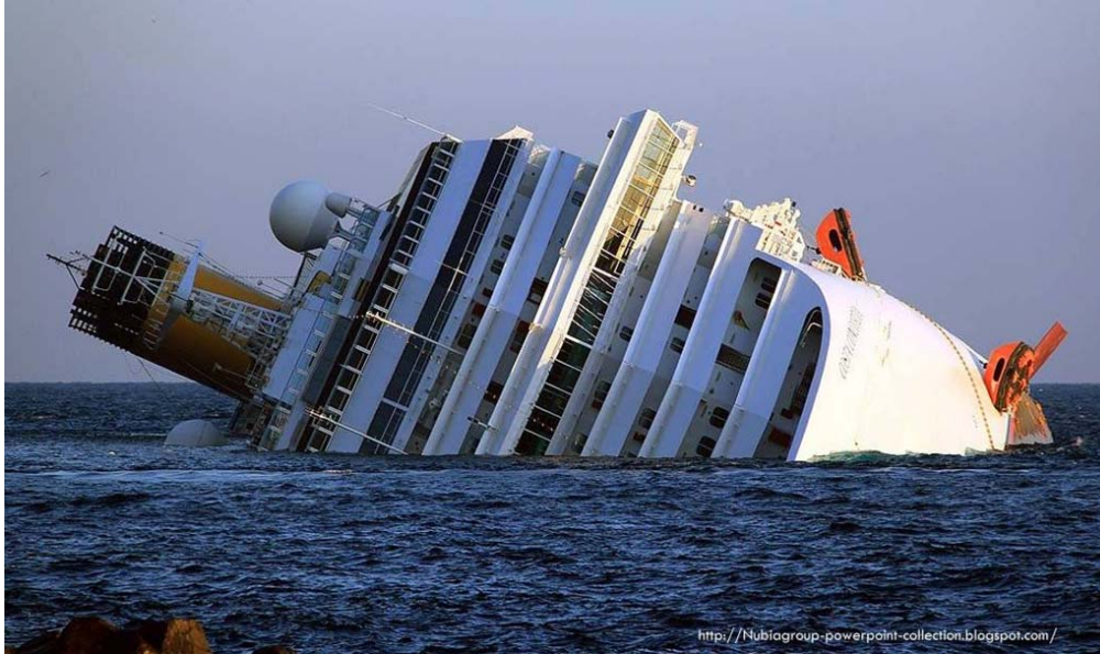
Giglio, Italy — The cruise ship Costa Concordia lies stricken.