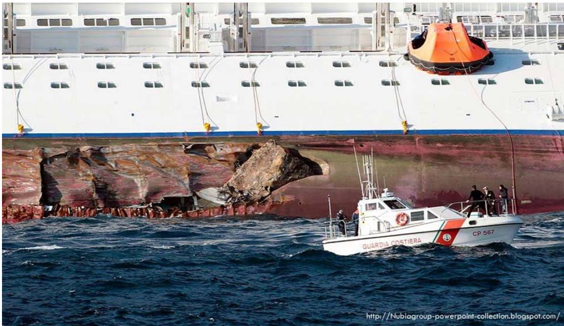
Giglio, Italy — Rocks are visible in the damaged hull the Costa Concordia.

As for the captain and master of the ship, if we follow Lilly quoting “ some” we can say that the captain was represented in the event chart by the 7th house, Aquarius, a house that is in opposition to the Ascendant.